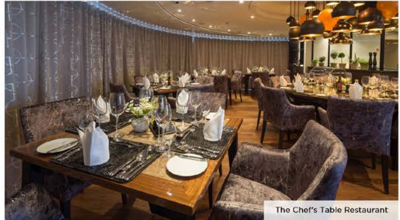
The Chef's Table Restaurant